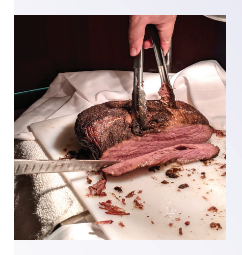
CHEF-CARVED BEEF BRISKET Add $2/person