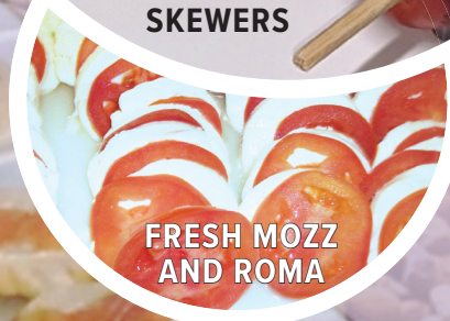
FRESH MOZZ AND ROMA